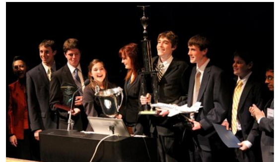
Baldwin High School Team-2010 National Winner

The Real World Design Challenge is an annual high school competition run by a public-private partnership with the goal of sustainably increasing the Science, Technology, Engineering, and Mathematics (STEM) workforce. The partners are focused on working within the context of the American educational system to transform STEM education in the United States by providing professional science and engineering and learning resources to students and teachers.